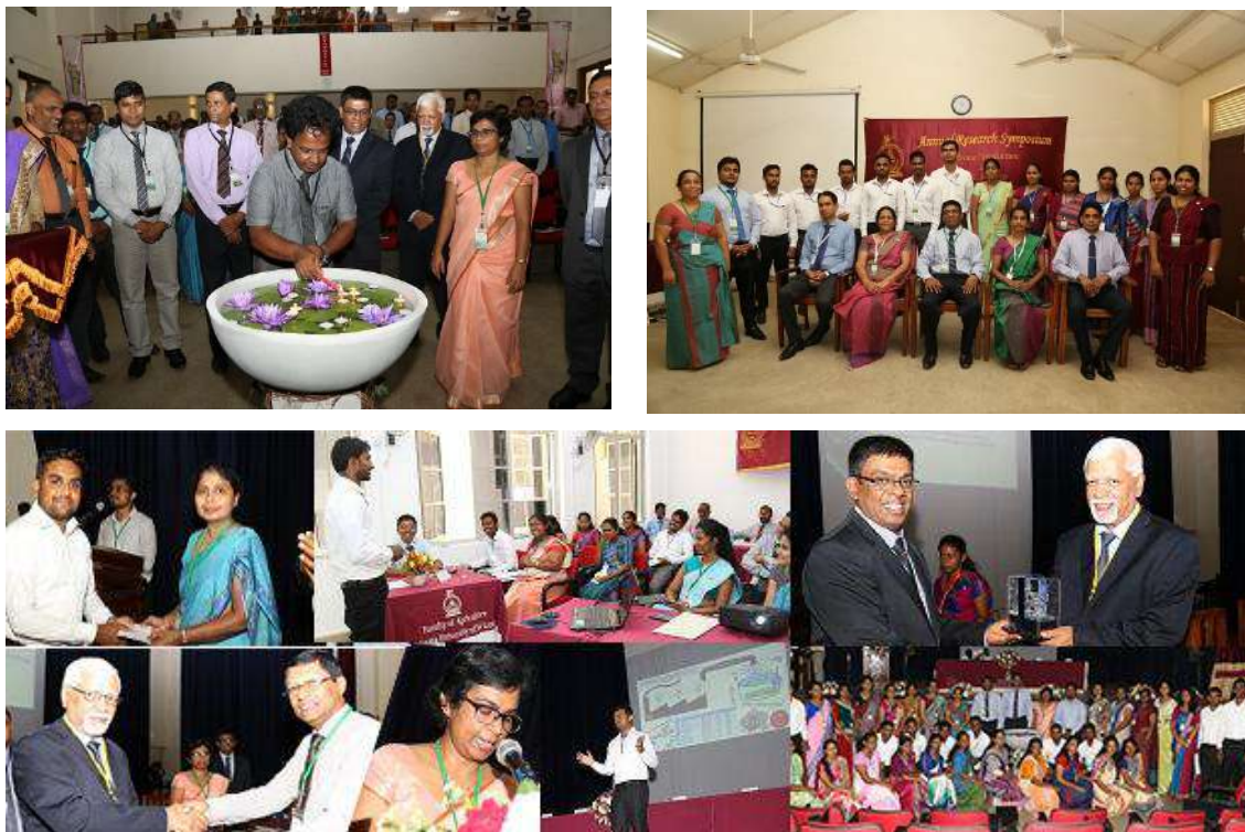
10 th Annual research symposium 2018