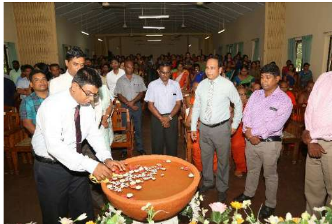
PGD Inauguration - 2018