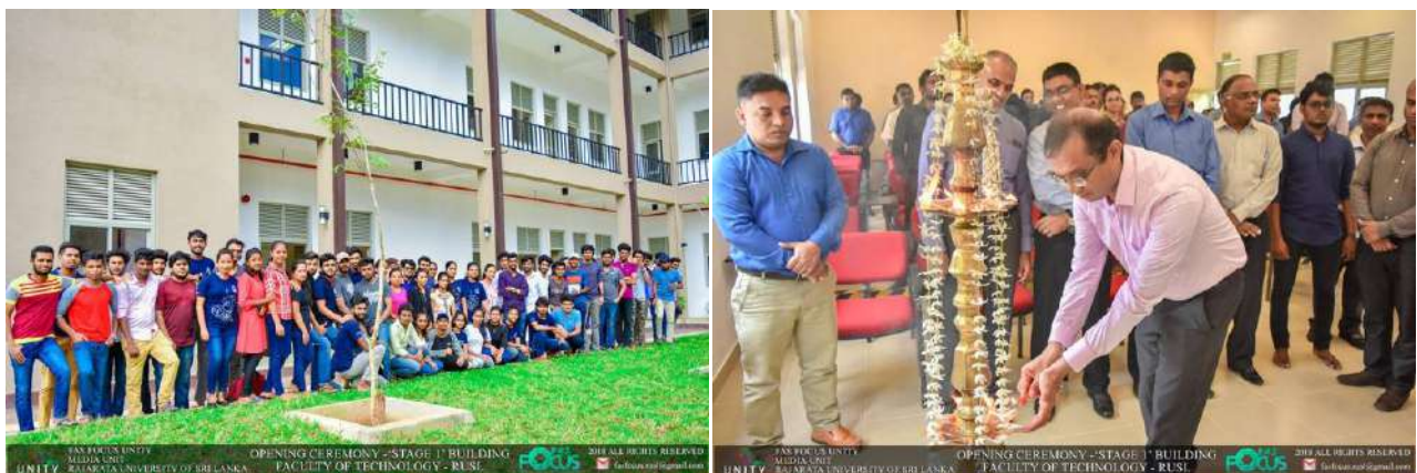
Opening Ceremony 'Stage 1' Building