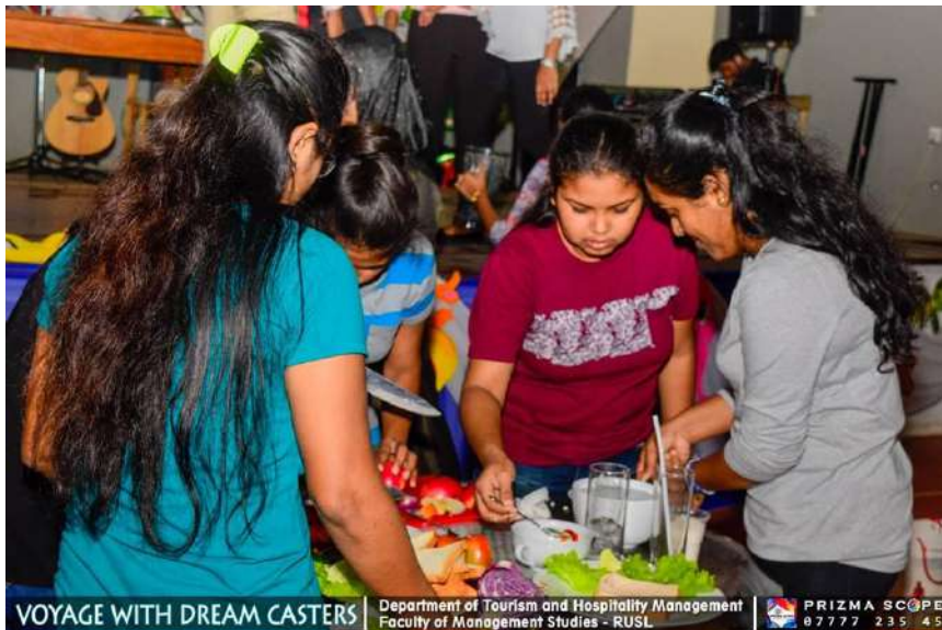
Voyage with dream casters