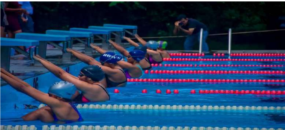
University Swimming pool at the Inter University Tournament -2018

In 2019 we hope to include other two sports for our internal tournaments.