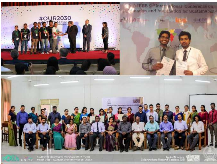
ICT students achievements (upper) and Staff with Best Presenters in Undergraduate Research Symposium (ASURS-2018) (below)