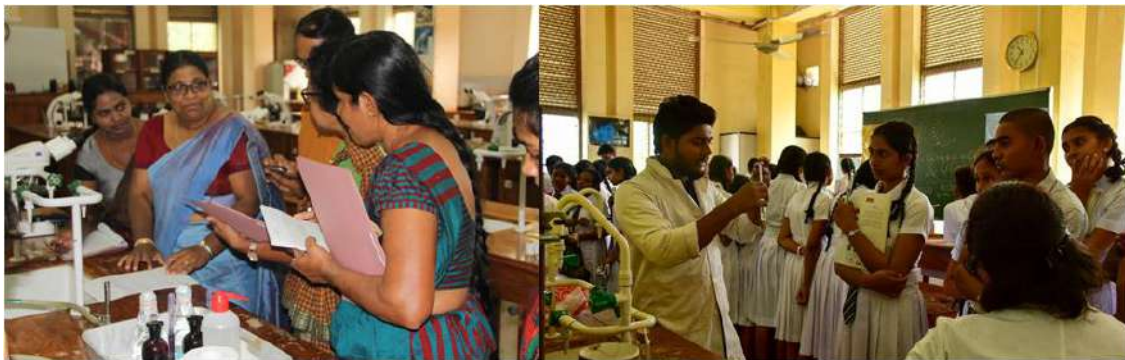
Workshop conducted for the A/L/teachers and students