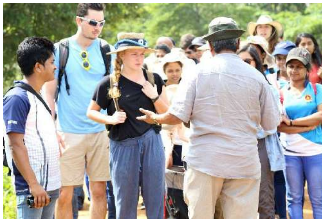
Workshop regarding tank cascade system