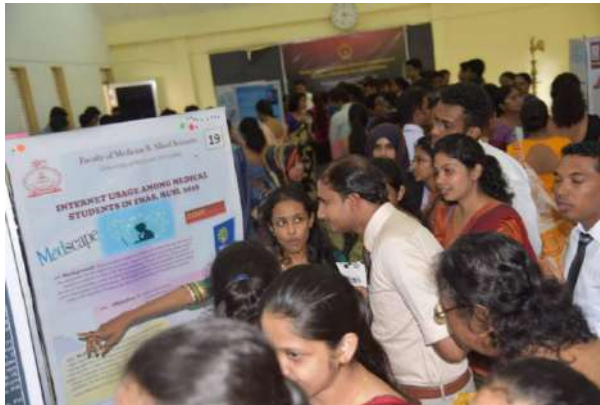
First Undergraduate Research Symposium - 2018