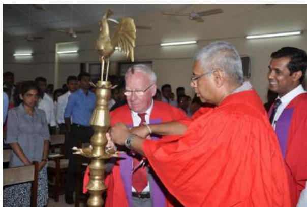
Inauguration - 2018 (2016/2017 Batch)