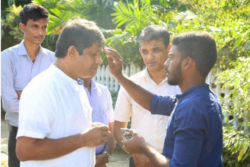
Social and Ethnic Harmony